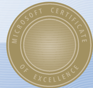
Steven A. Ballmer Chief Executive Officer

A handwritten signature in black ink, which appears to read "Steven A. Ballmer". The signature is fluid and cursive.